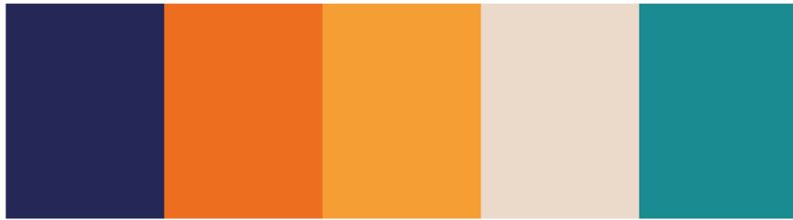
Five colour combination