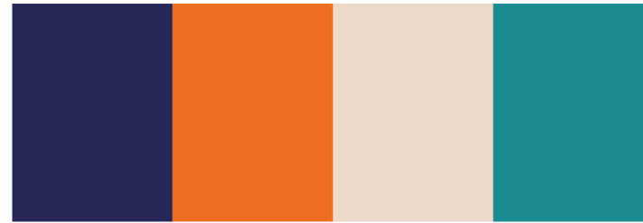
Four colour combination